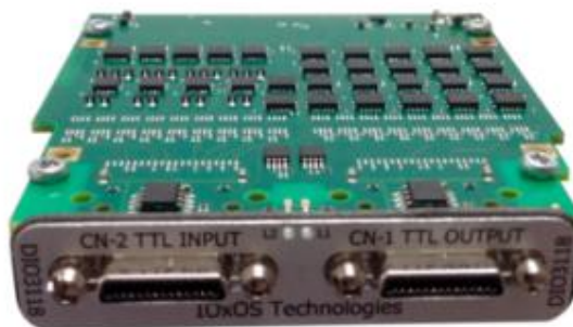
Figure 3: IOxOS DIO3118 DIO FMC board [6].