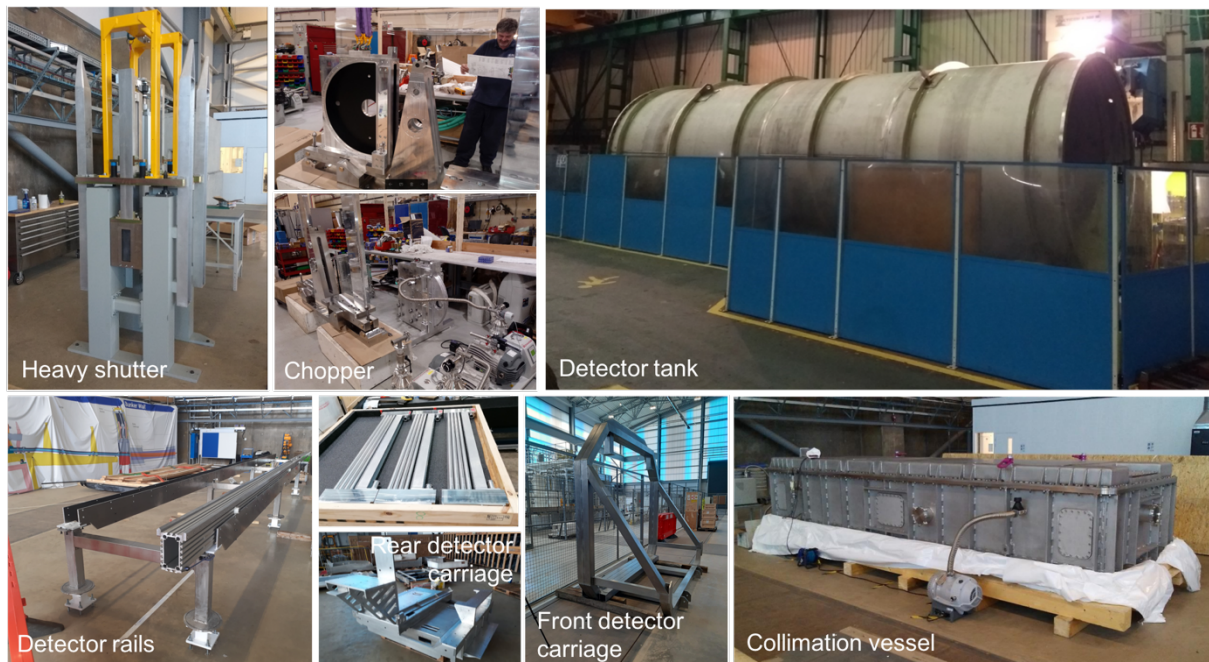
Figure 3.1 Photos of some key LoKI components currently under manufacture or pre-assembly at ISIS