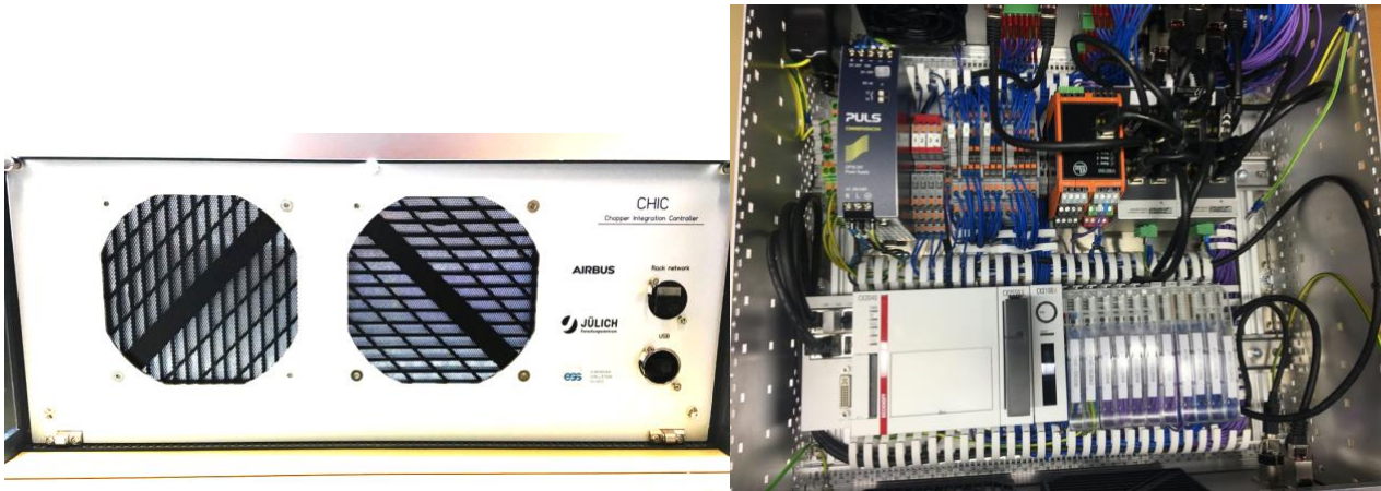
Figure 2. Left: Final layout of chopper integration controller. Right: Finished assembly of the 1st production model of the CHIC controller.