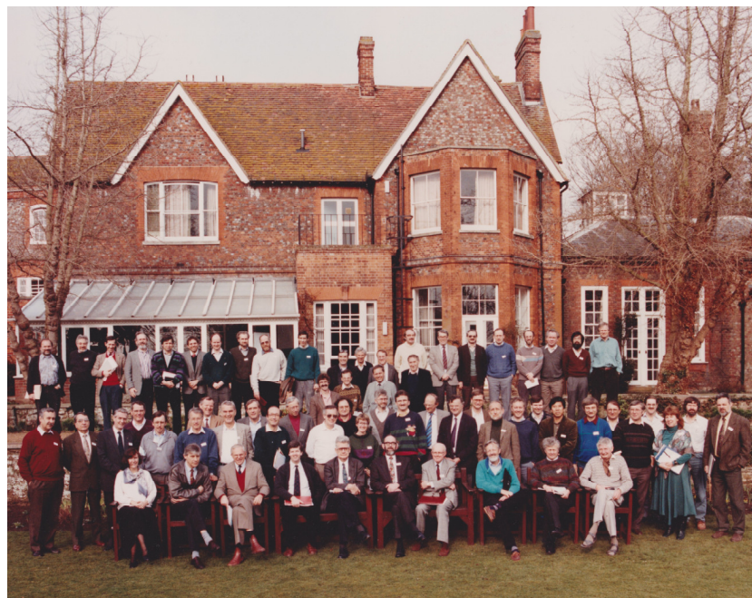
Second ESS meeting 1992