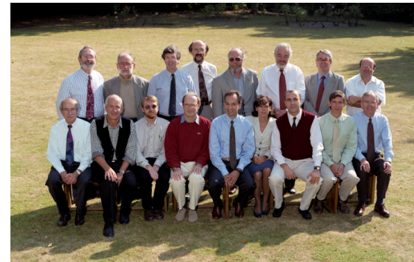
Neutron Round Table 1994