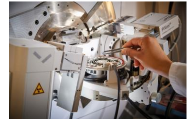
Thin layer X-ray Diffractometer \lambda(\text{Cu})