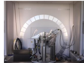
Powder X-ray diffractometers \lambda(\text{Co}) et \lambda(\text{Cu})