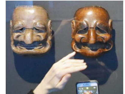
Japanese traditional masks “Kyogen” 18 th century